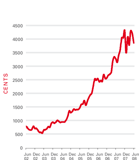
SHOPRITE HOLDINGS LTD SHARE PRICE